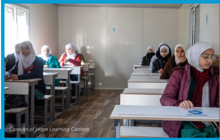
Caravan of Hope Learning Centers

Many Syrian families have opted to reside near farms for convenient access to employment opportunities. However, these farms are often distant from formal schools, leading to children dropping out and engaging in work at a young age.