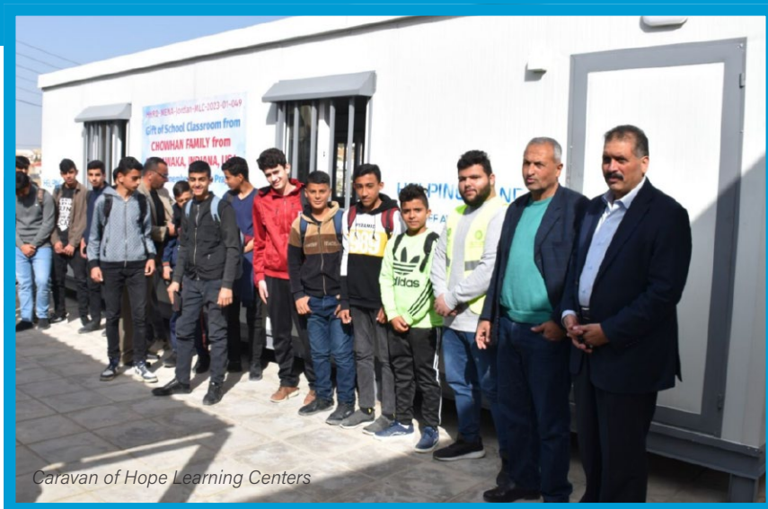
Caravan of Hope Learning Centers

To support this refugee segment and alleviate Jordan's already overcrowded classrooms, HHRD initiated the Caravan of Hope Learning Center project in collaboration with the Ministry of Education. These robust, weather-resistant classrooms provide an ideal setting for young individuals to develop essential skills needed to pass national tests and eventually enroll in formal schools. Each learning center is equipped with a classroom, whiteboard, desks for both teachers and students, and fully functional restroom facilities.