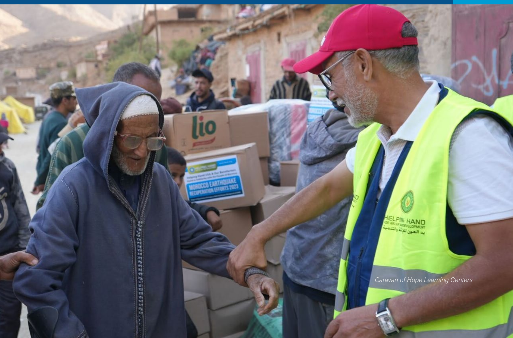
Caravan of Hope Learning Centers

HHRD has established a presence in Morocco to provide food supplies and Qurbani meat. When the earthquake occurred on September 8, 2023, the MENA team initiated relief efforts. Following the distribution of food, fresh water, and hygiene supplies, the Shelter Relief Program was activated. In collaboration with regional partners, HHRD is committed to providing the following homes and structures in the Taroudant & Al-Houz regions near Marrakech: