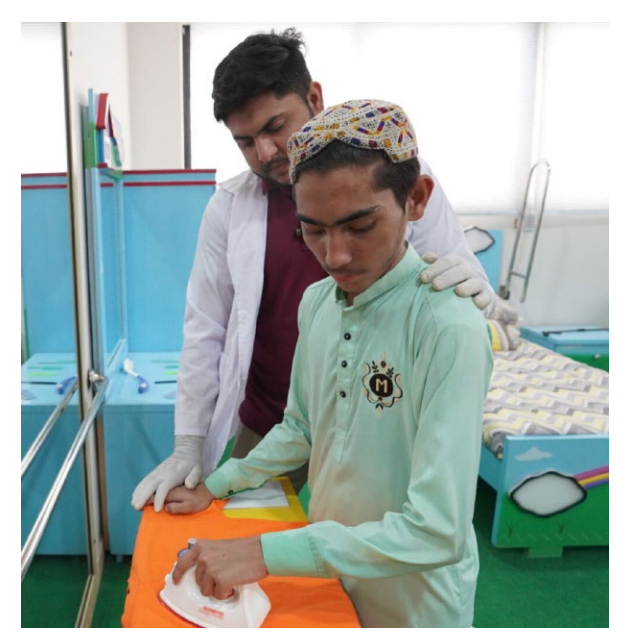
Assistance with daily activities.

HHRD also provides assistive devices like wheelchairs, crutches, hearing aids, brail tablets and other support that improves the quality of life and helps these children with their mobility, communication and learning.