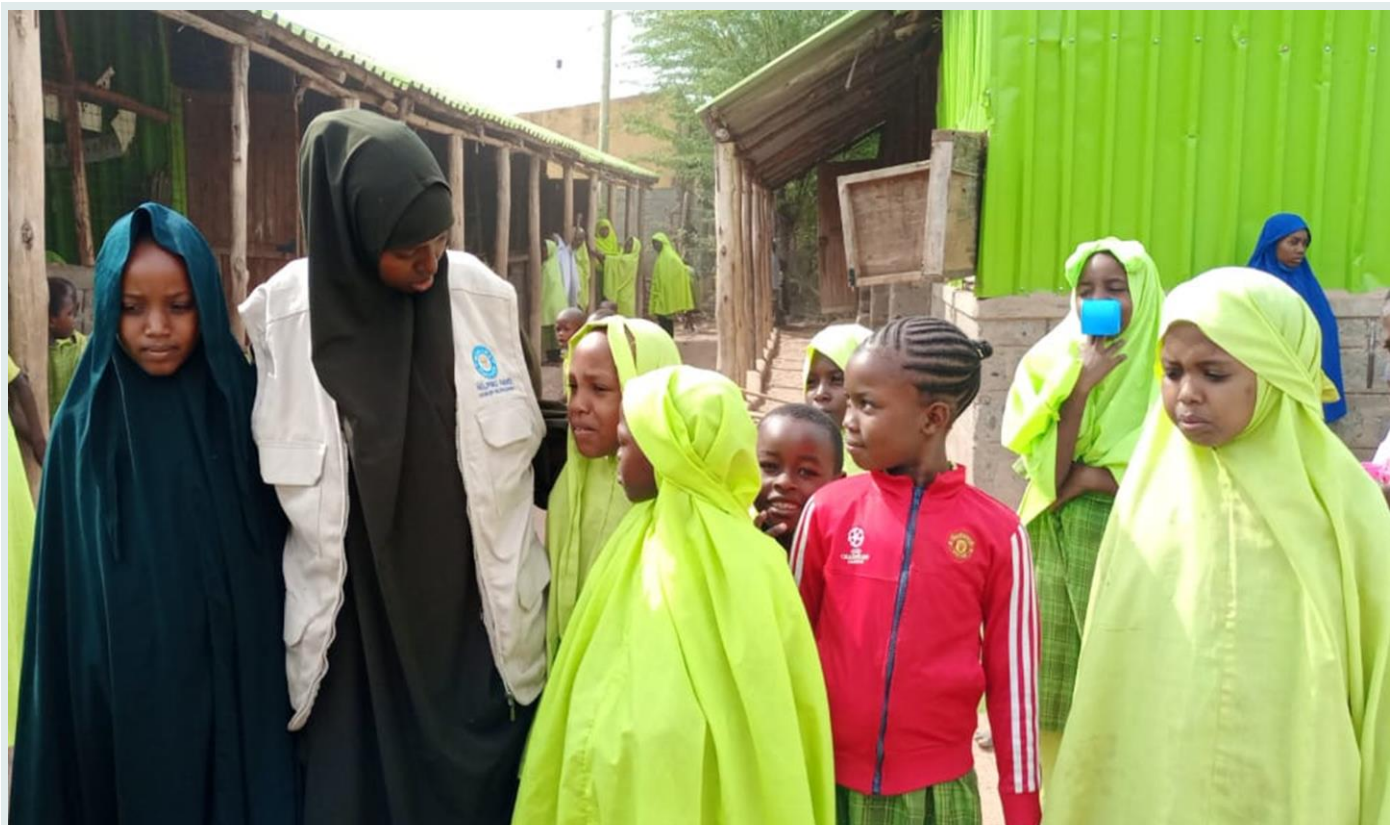
Field staff conducting school visit to sponsored students at Bridge International School in Madogo, Kenya.